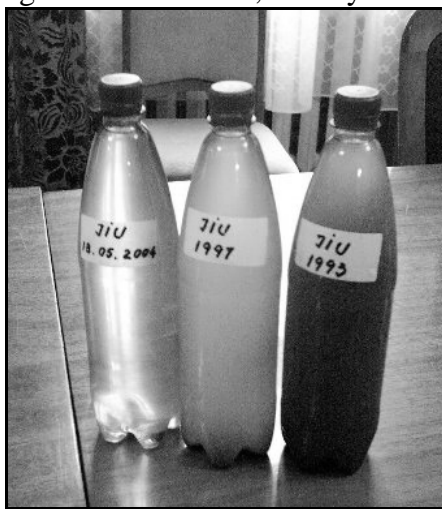
Fig. 2 The water samples from Jiu river in the years 1993 (right), 1997 (middle), 2004 (left).

Eloquent for the improvement of the Jiu water quality it's an image of samples from the river in the years 1993, 1997, 2004 (figure 2), presented by the Jiu Waters Direction Craiova at Symposium dedicated to purge Jiu river waters, in May 2004.