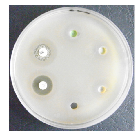
Figure 2. Total resistance of sample 6 to Cu-based products and two wide-spectrum antibiotics