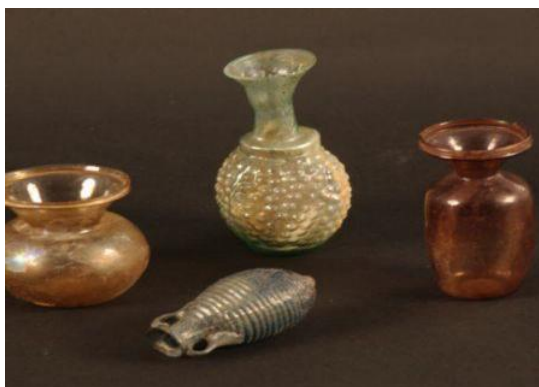
Fig. 4. Set of Roman Bottles ( http://flickrhivemind.net )

Fragrances have been added to wines, and they are also used to fragrant animals. At religious ceremonies, the number and variety of fragrances were impressive, similar to the diversity encountered in bottles containing them. (Figure 4).