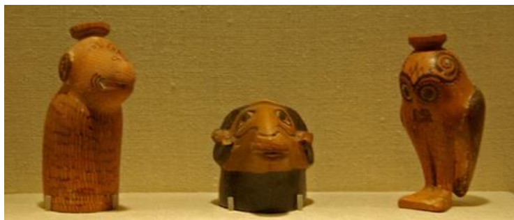
Fig. 2. Greek Bottles for Perfume

Greece. A major role in the history of perfumes was played by Greece, where the ideals of beauty, harmony, proportion and balance played a fundamental role not only in art, but also in everyday life. It was no surprise to anyone that perfumes and oils would become the favorite elements of those who assigned them a divine origin. According to Homer, the Olympian Gods taught people the secrets of perfume making and use, and in many Greek mythology scenes, perfumes, aromas and essences are created by goddesses, nymphs and other characters.(Figure 2).