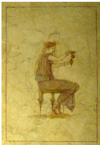
Fig. 3 The interest for perfume of Romans

Fragrances have been added to wines, and they are also used to fragrant animals. At religious ceremonies, the number and variety of fragrances were impressive, similar to the diversity encountered in bottles containing them. (Figure 4).