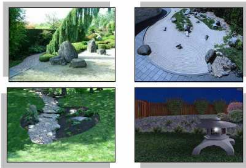
Fig. 2. Characteristic and primordial elements of the garden facing southwest Feng Shui