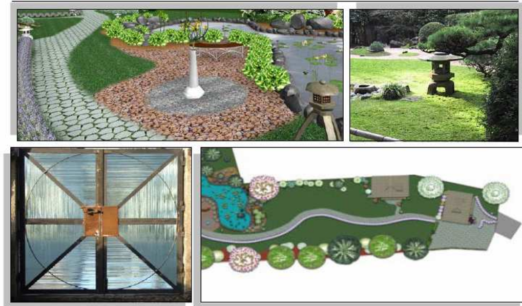
Fig. 4. Feng Shui Northwest-oriented garden