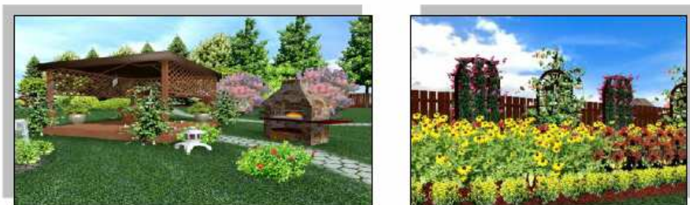
Fig. 1. Garden of Fame and Reputation

Garden facing southwest Feng Shui: Garden of Love: belongs to the earth element, which we chose to incorporate gravel with boulders to symbolize miniature mountains, stone lanterns are lit throughout the night to continue the cycle production started in South Feng Shui element of fire which will then give rise earth element (rocks, gravel, boulders).