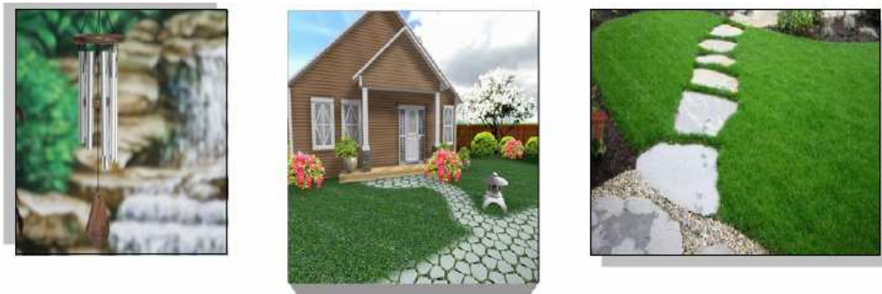
Fig. 3. Government elements of the West Feng Shui garden

Garden oriented to the Northwest Feng Shui: Garden of bystanders: entrance area overlaps the perimeter of the garden, a continuation of the West Garden, which make the transition easily from the metal part production cycle from water. Textures used are the same as those mentioned in garden oriented in the West Feng Shui. Sub-areas that make up this garden are the main entrance in the courtyard, paved with stone slabs, two buildings and some of the main decorative.