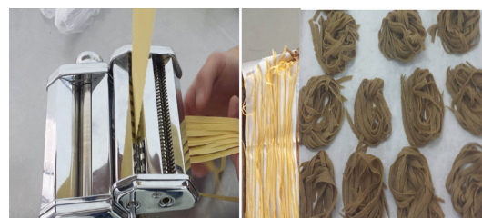
Fig. 2. Drying pasta

to present antimicrobial, antitumor and immunomodulation characteristics; they inhibit placental aggregation, reduce blood cholesterol concentration, prevent the development of heart disease and reduce the amount of blood glucose (Barros et al. , 2007; Lindequist et al. , 2005; Reis et al. 2012). Because of their nutritional value, mushrooms become appealing as a functional product but also as a rich source of proteins, fibers, fat acids, vitamins and other active biological compounds (Heleno et al. , 2012; Nedelcheva et al. , 2007). Moreover, besides their medicinal purposes, mushrooms also prove a significant antioxidant capacity. Among the antioxidant compounds, polyphenols have gained specific importance, because of the variety of biological action which includes the absorbance of free radicals and, amongst others LDL oxidation inhibition (Keleş et al. , 2011).