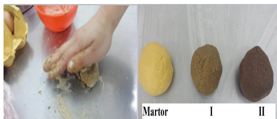
Fig. 1. Dought (PM, P I, P II)