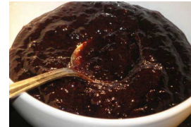
f-Plums jam without sugar