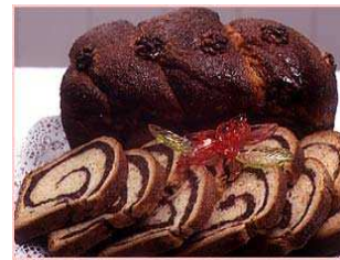
h- Cozonac (sweet baked good)

Fig. 2. Traditional Transylvanian Food (Source: http://delly.garbo.ro/articol/Retete-culinare/14765/varza-a-la-cluj.html , http://www.gustos.ro/retete-culinare/mancare-de-fasole-cu-ciolan-afumat.html , http://www.restaurantedelux.ro/ciolan-de-porc-afumat-cu-fasole-sau-varza-calita.html , http://truedelights.ro/2010/04/12/supa-c,u-galusti/ http://sanatate.bzi.ro/magiunul-de-prune , http://www.retete-super.ro/muraturi-pentru-iarna-in-borcan/ http://retete-bucatar.blogspot.ro/2009/07/cozonac-cu-nuca.html )