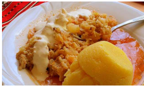
a-Cabbage á la Cluj