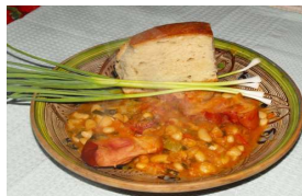
b- Beans and smoked bacon