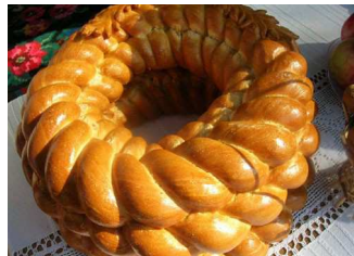
g- Traditional bread