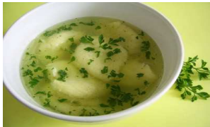
d- Chicken soup with dumplings