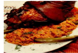
c- Cabbage with smoked pig leg bone