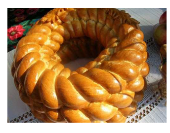
g- Traditional bread