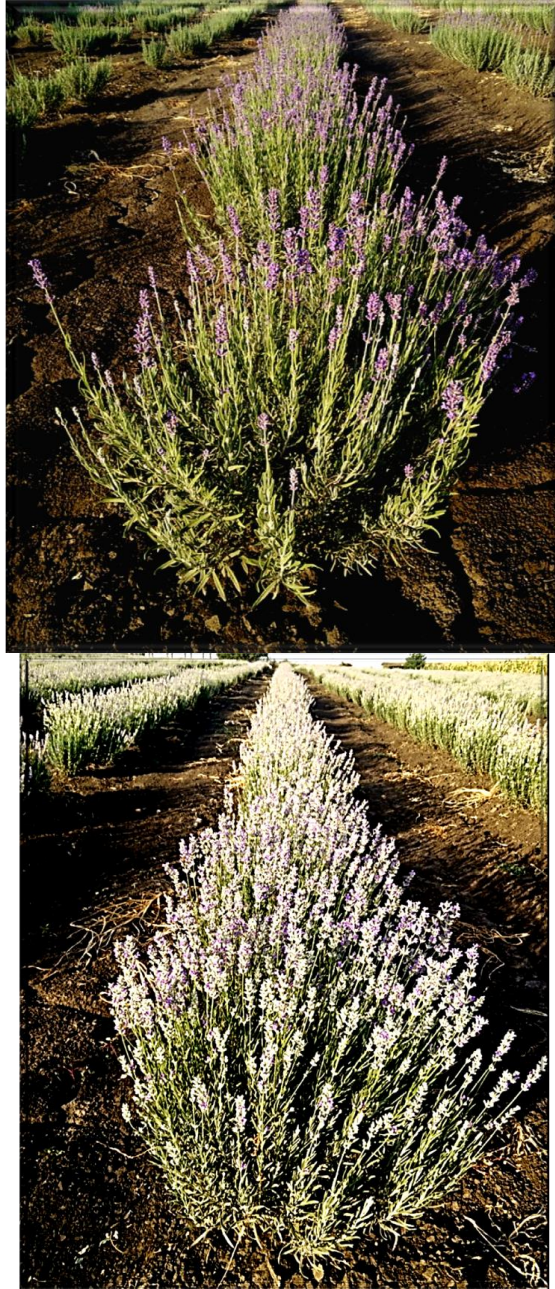
Figure 3. A lavender plantations founded in November 2017, Colonița, Republic of Moldova, first year of vegetation, second bloom, 2018, August 27; up variety Vis Magic 10; down variety Alba 7.